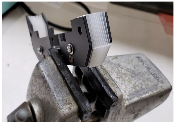
FIGURE 4—This image shows the altered plastic cover.