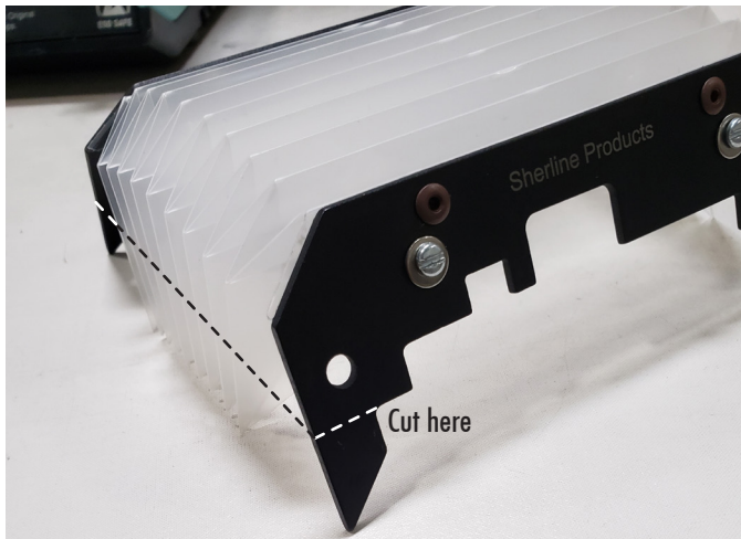
FIGURE 1—Front view.