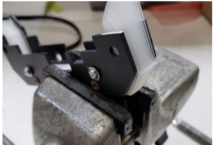
FIGURE 3—This image shows the metal end plates after removing the tabs on the left-hand side of the way cover.